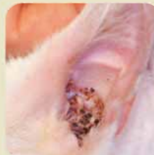
Otitis externa in a cat with ear mites ( Otodectes cynotis ). The photo shows the characteristic crusty brown discharge in the external ear canal